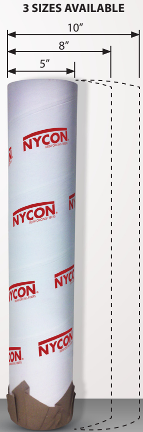
Tube shown with top cap removed.

*Protected by US Patent #6,554,465 - other U.S. and foreign patents pending